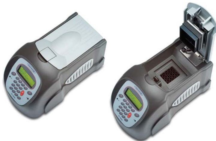
Uniformity of Temperature Across Sample Block

The TC-3000 thermal cycler is unrivalled as a reliable low cost Personal cycler. Designed for research and teaching, the TC-3000 offers the ultimate in low cost solutions where ease of use is high on the priority list.